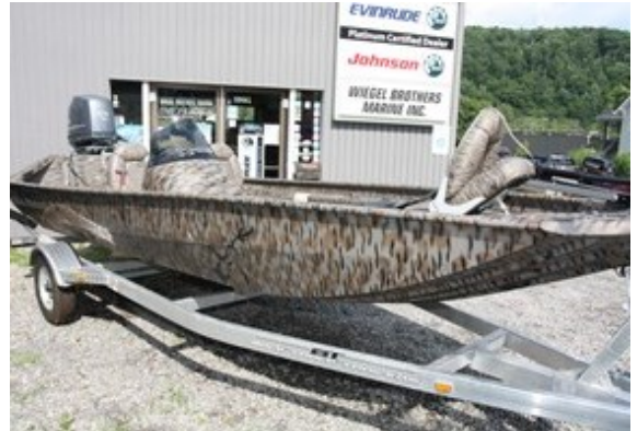
Boat of the Month: Debbie is declaring July as Express Jetboat month at Wiegel Brothers. Stop in to