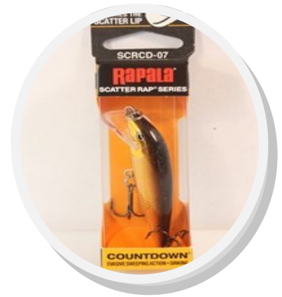
Scatter Rapala is hot for walleyes

Dave @ Richter's Bait ; filed 7/7: "Things at Pymatuning are in the summer patterns. Customers are still picking up a few walleyes, but you got to work for them. Catfish are being caught everywhere. There's been a lot more mention of largemouth bass being caught than in past years; bass are in the weeds. The Shenango River below the dam is giving up good crappies and walleyes due to the high water."