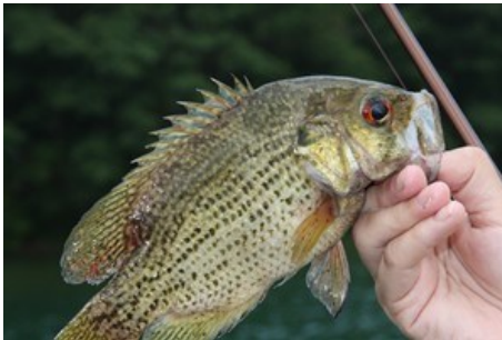
Sunfish species A: