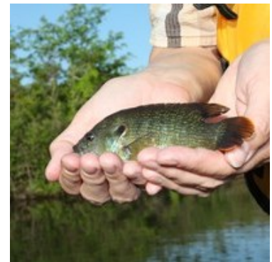
Sunfish species C: