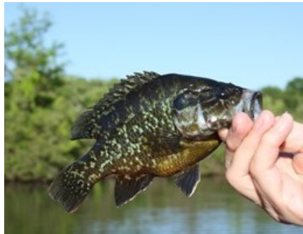
Sunfish species B: