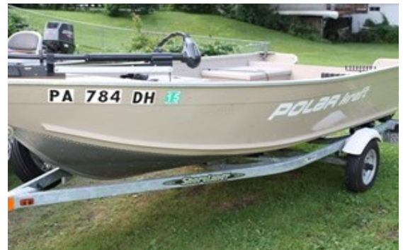
Check out Wiegel's used boats, too.